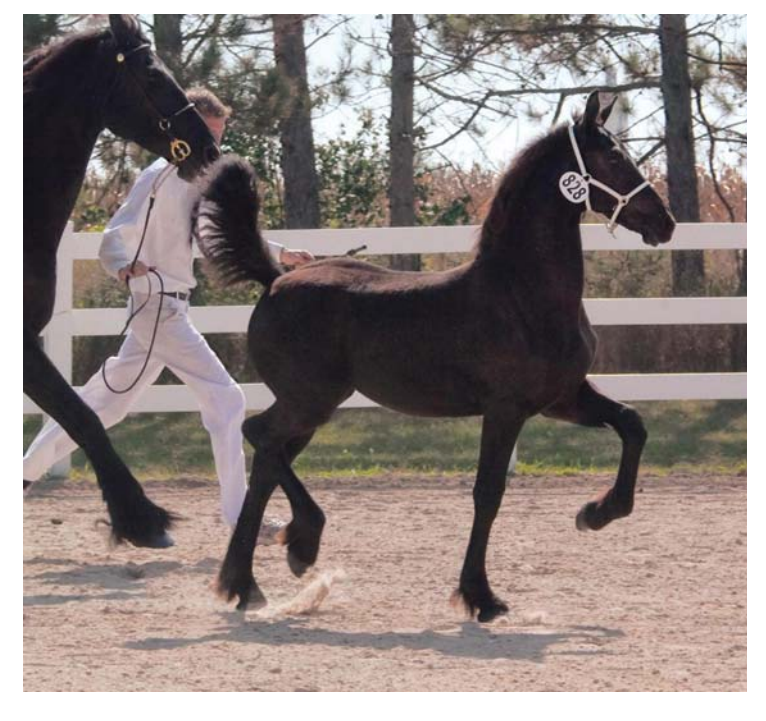
The Wisconsin State Horse Council, Inc. is a non-profit organization representing horsemen and women and the equine industry. The WSHC promotes the horse through leadership, education, and service and takes a proactive role in the growth of the industry.